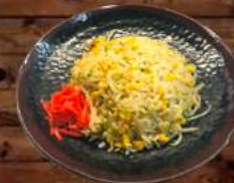
*Vege Fried Rice $7.25