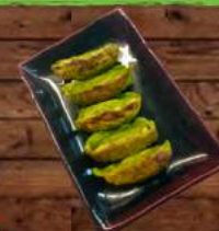
*Vege Gyoza $3.98