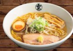
*Miso Ramen (Thick, Rich, Slightly Sweet, and Flavorful)