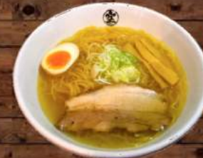
*Shio Ramen (Salt Based Broth. Clear and lighter Flavor.)