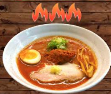
*Killer Spicy Umami Ramen $10.50