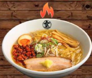
*Spicy Ramen $9.75