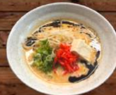
*Vegetable Ramen $9.00

If the flavor of your soup is too strong we have a soup broth to tone it down upon your request. All of our TOPPINGS are kept under regulated temperatures in order to follow food safety guidelines. Please ask server about our menu!!!