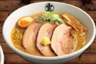
*Chashu Ramen $11.00