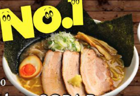
*Deluxe SORA Ramen $11.40