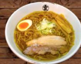
*Shoyu Ramen (Soy Sauce Based Broth. Clear Brown Soup That is Savory)

If the flavor of your soup is too strong we have a soup broth to tone it down upon your request. All of our TOPPINGS are kept under regulated temperatures in order to follow food safety guidelines. Please ask server about our menu!!!