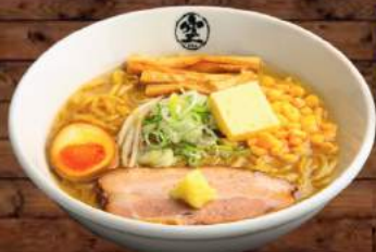
*Corn Butter Ramen $10.00