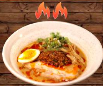
*Spicy Umami Ramen $10.00