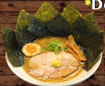
*Nori Ramen $9.75