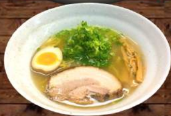
*Negi Ramen $9.50