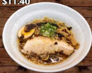
*Ma-Yu Ramen $9.50