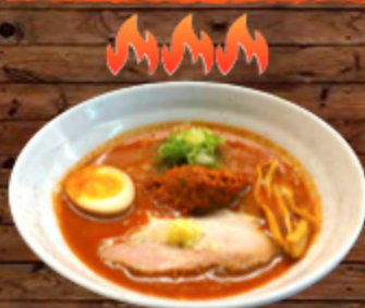
*Killer Spicy Umami Ramen $10.85