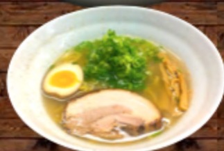
*Negi Ramen $10.10