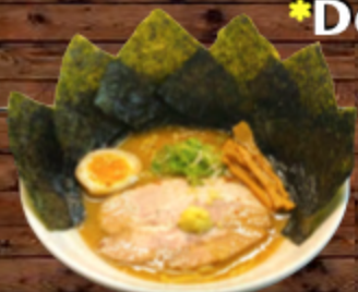
*Nori Ramen $10.20