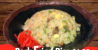
Pork Fried Rice $6.98

Combination of Seared Chashu, Menma, and Flavored Egg