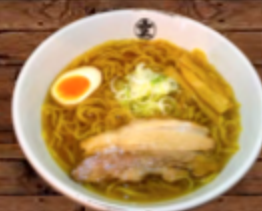
*Shoyu Ramen (Soy Sauce Based Broth. Clear Brown Soup That is Savory)

If the flavor of your soup is too strong we have a soup broth to tone it down upon your request. All of our TOPPINGS are kept under regulated temperatures in order to follow food safety guidelines. Please ask server about our menu!!!