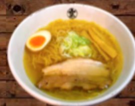
*Shio Ramen (Salt Based Broth. Clear and lighter Flavor.)