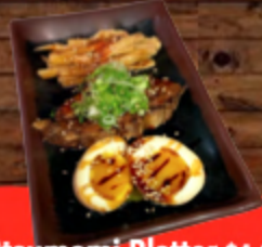
*Otsumami Platter $4.25

Combination of Seared Chashu, Menma, and Flavored Egg