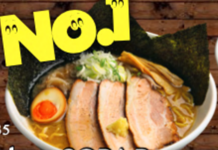
*Deluxe SORA Ramen $11.90