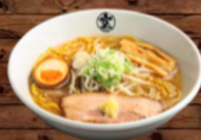
*Miso Ramen (Thick, Rich, Slightly Sweet, and Flavorful)