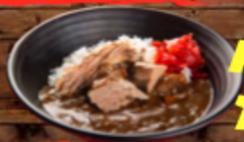
Mini Chashu Curry Bowl $5.00 → $3.98