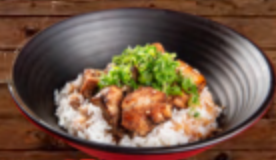
Mini Chashu Bowl $5.00 → $3.98

** Garlic Edamame is Available for $3.75