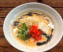
*Vegetable Ramen $9.35

If the flavor of your soup is too strong we have a soup broth to tone it down upon your request. All of our TOPPINGS are kept under regulated temperatures in order to follow food safety guidelines. Please ask server about our menu!!!