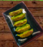
*Vege Gyoza $3.98