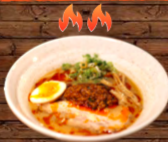
*Spicy Umami Ramen $10.35