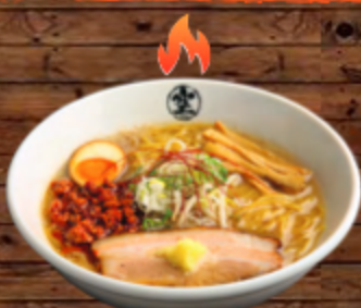
*Spicy Ramen $10.10