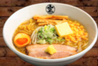
*Corn Butter Ramen $10.35