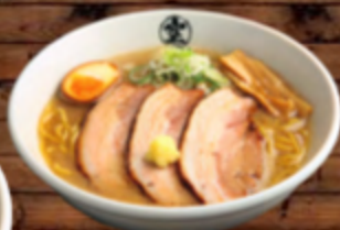
*Chashu Ramen $11.50