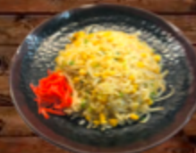
*Vege Fried Rice $7.25